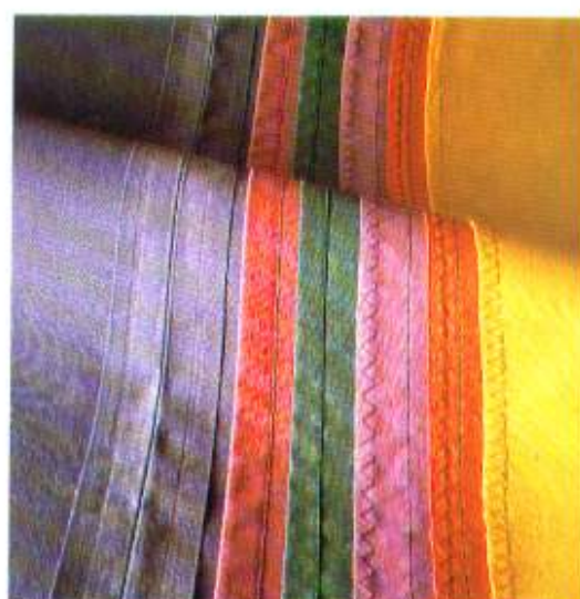
Basic Seams ..... 16 Timesaving Accessories ..... 18 Hand Stitching ..... 20 Padded Work Surface ..... 21