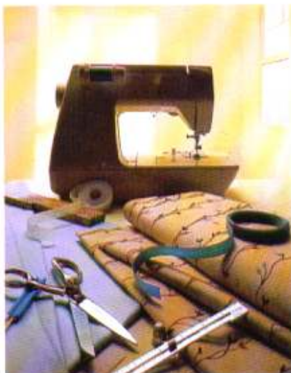
How to Use This Book..... 7