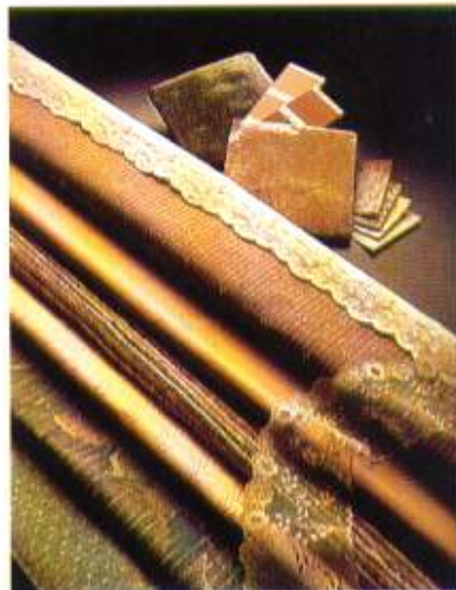
Fabrics for Home Decorating..... 9 Mixing & Matching Fabrics..... 10 Choosing Colors..... 11