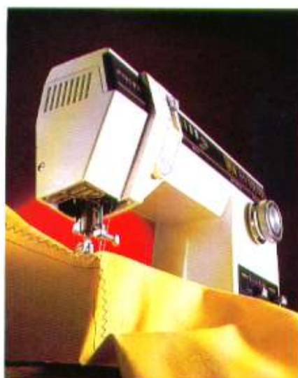
Machine Stitching ..... 14