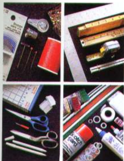
Equipment & Notions ..... 12