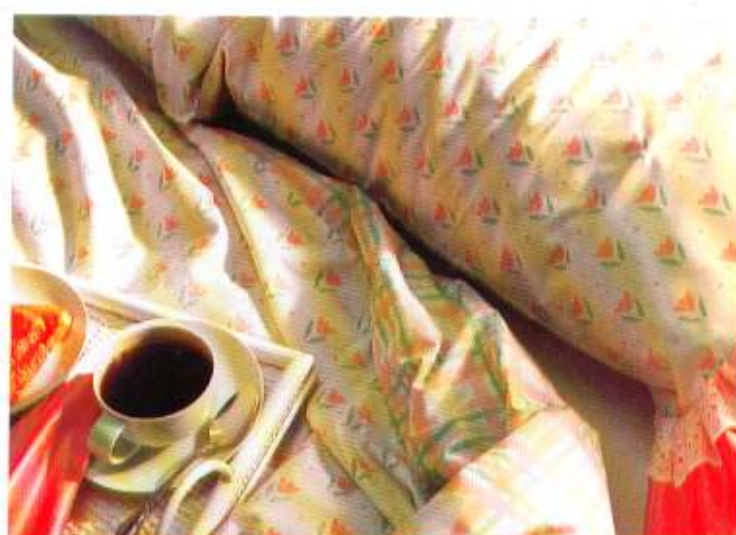
Beds ..... 111